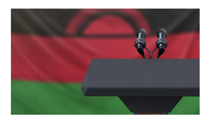
Malawi at a cross roads: the opportunities and threats that lurk in political crises By Khumbo Bonzoe Soko