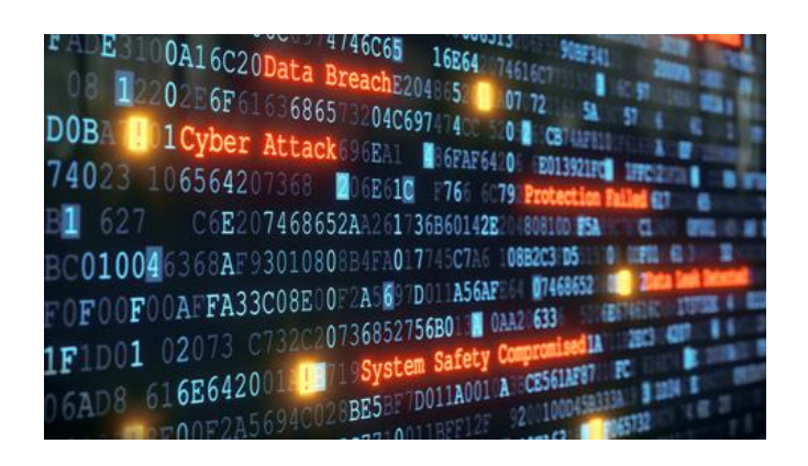
The Weakest Link